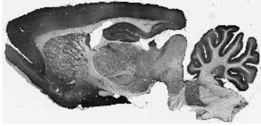
Adult rat brain immunohistochemistry.

Product Page URL: www.antibodiesinc.com/products/anti-gaba-a-r-beta1-antibody-n96-55-75-137