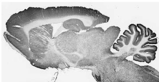
Adult rat brain immunohistochemistry.