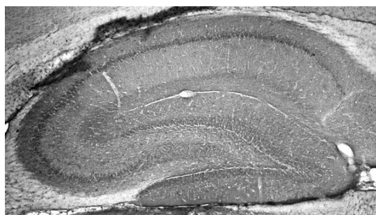
Adult rat hippocampus immunohistochemistry.